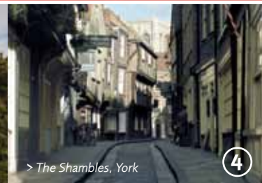
> The Shambles, York