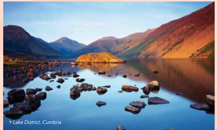
> Lake District, Cumbria

York was once the capital of a Viking kingdom, and this ancient heritage is tightly bound up in the unique character of the city. Visit the Jorvik Centre to learn about life under the rule of the Vikings 1,000 years ago. In the evening take a York ghost tour and hear some of the city's darker secrets.