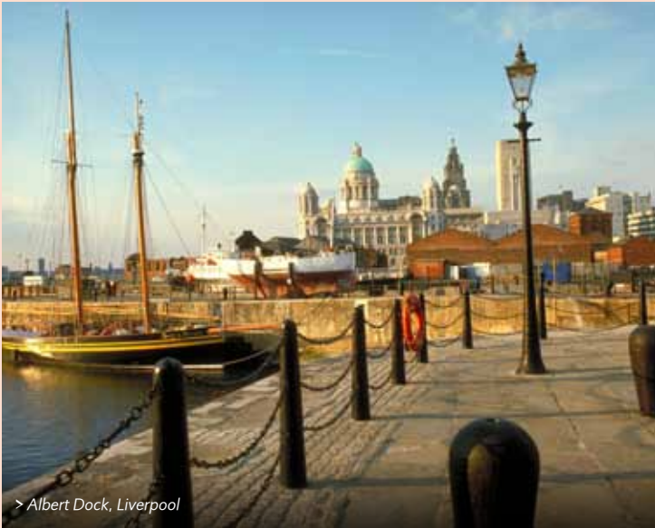
> Albert Dock, Liverpool

After visiting some of England's best galleries, Tate Liverpool and the Walker Art Gallery among them, join the city's many revellers at the trendy bars and restaurants of Seel Street to sample the lively Liverpool nightlife.