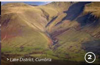
> Lake District, Cumbria