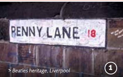
> Beatles heritage, Liverpool

Sumptuous Georgian gardens, medieval castles and literary heritage await you in the north of England, along with the warmth and hospitality the region is famous for. You'll discover the awe-inspiring sights of the Lake District, taste delicious local cuisine and see what inspired many of England's poets.